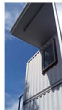
Sample of a home that was built in California using cargo containers.