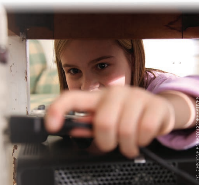
TOUCHSTONE ENERGY COOPERATIVES